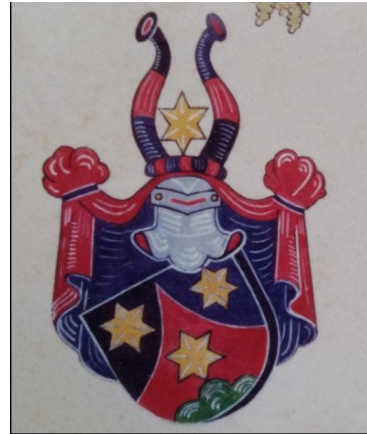
This picture better represents the colors in the translated text.